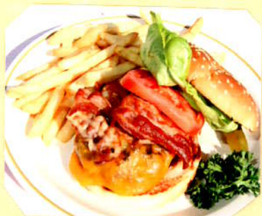
(Bacon Cheese Burger)

Queen's Beach famous Homemade Hamburger, grilled to perfection