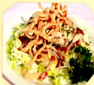
Chinese Chicken Salad